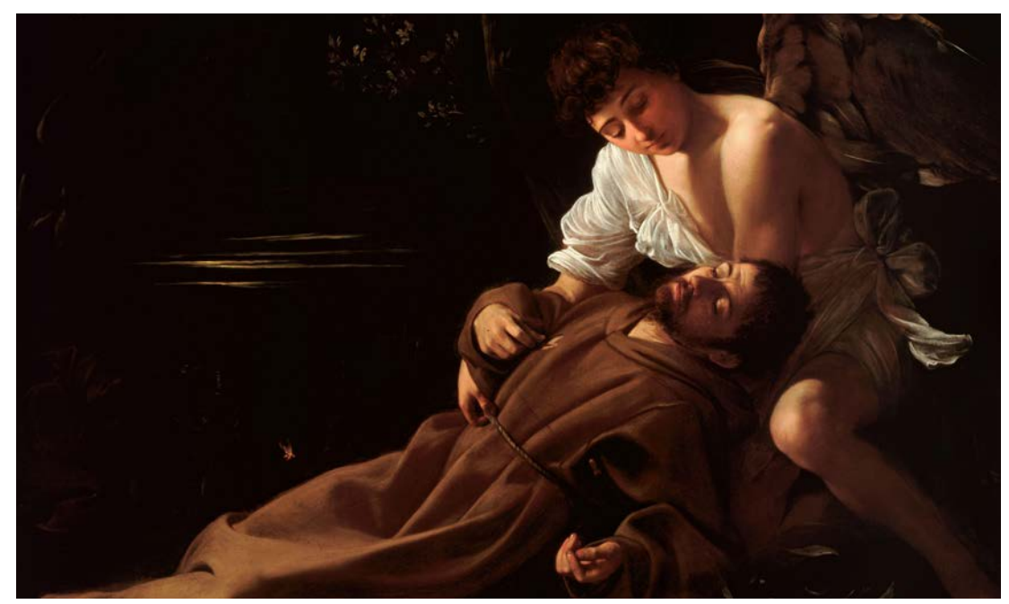
St. Francis of Assisi in Ecstasy

Central to Cox's theme and belief is that science and art are close companions; creative thinking often being key to ground breaking and breathtaking results. The three hands are from that of an average sized male and are sleeved with a cuff of simple style, belonging to no particular era.